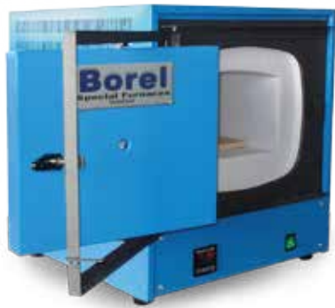
Laboratory chamber furnaces