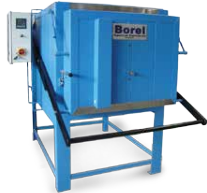
Industrial chamber furnaces