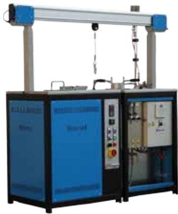
Furnaces for work under controlled atmosphere