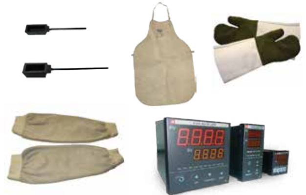
Muffles, crucibles, regulators, gloves, apron, high temperature mittens, head protection, hide sleeves