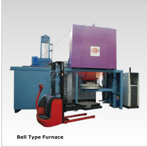
Bell Type Furnace