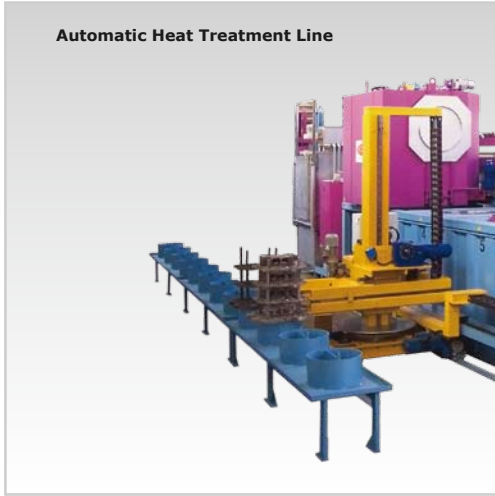
Automatic Heat Treatment Line