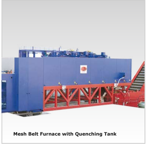
Mesh Belt Furnace with Quenching Tank