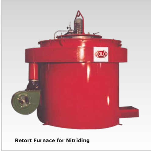
Retort Furnace for Nitriding