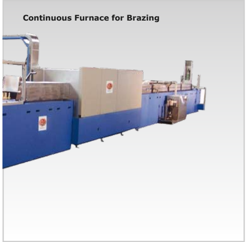
Continuous Furnace for Brazing